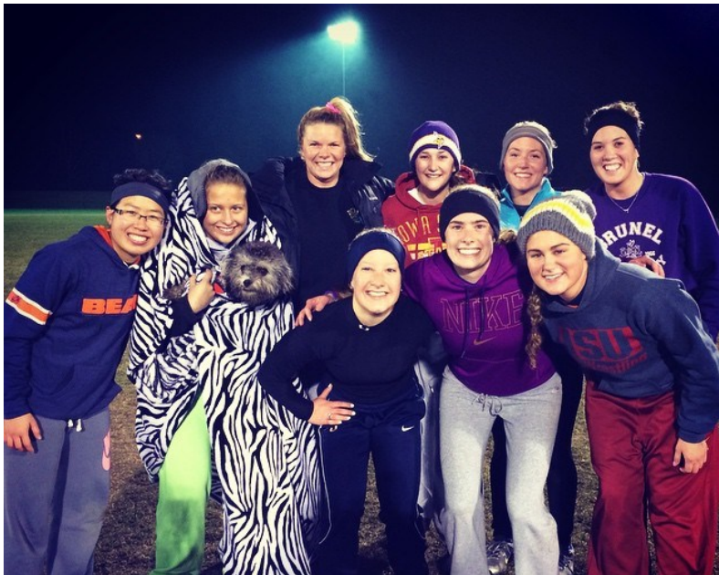
SWE Intramural Team

The alumni of ISU first began returning home for an official Homecoming in 1912. Since then, the celebration continues to entertain both young and old Iowa Staters, with traditional events, including tailgating prior to the homecoming football game, fireworks, lawn displays, “Yell Like Hell” cheering competition, and mass campaniling.