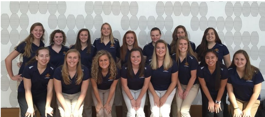
SWE in LA for WE'14 National Conference

Get involved in as many things as you can! It is great to have a ton of stuff to talk about with recruiters and put leadership skills on your resume to set you apart. Even if you don't have experience with an internship, recruiters love seeing that you are involved and developing other skills here on campus.