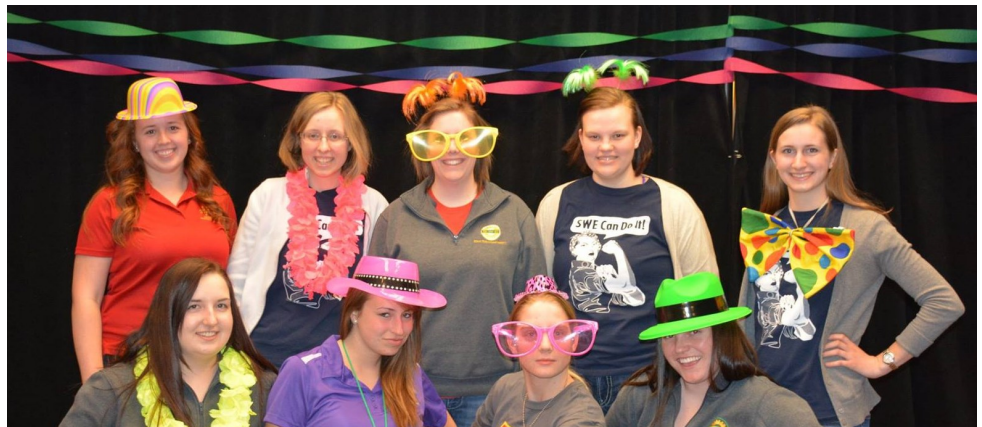
ISU SWE at Regional Conference at the University of Notre Dame

The CyRide busses will take you almost anywhere you would like to go on campus and around Ames. These are free to all ISU Students with your Student ID. A current bus schedule can be found at www.cyride.com .