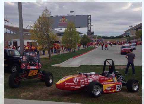
TOP: Cyclone Racing Formula Car along side Team Ethanol Car from the Indy Racing League. Cyclone Racing partnered with Team Ethanol to promote the use of ethanol. TOP CENTER: Cyclone Racing was featured on the cover of a Solid-works 2010 instruction manual. BOTTOM CENTER: Cyclone Racing participates in Iowa State University's VEISHEA parade. The parade is a timeless tradition attracting tens of thousands of onlookers each year. BOTTOM: CR-18 with Baja 2013 at an Iowa State football game.